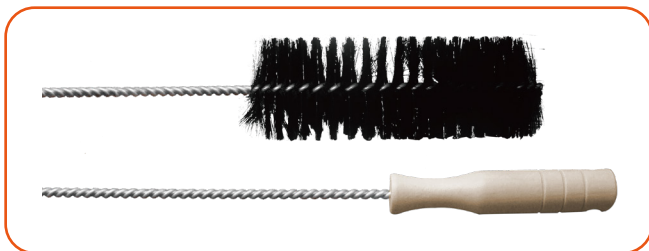
DUCT CLEANING BRUSH NO. 42529