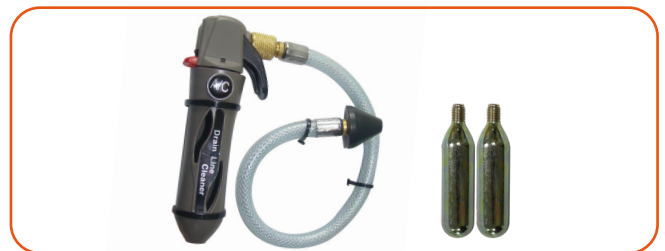
CONDENSATE DRAIN CLEANING TOOL NO. 86001-86004