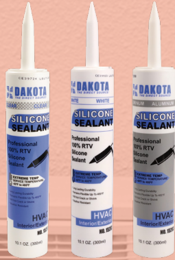
SILICONE SEALANT HOT NO. 15201-15204P